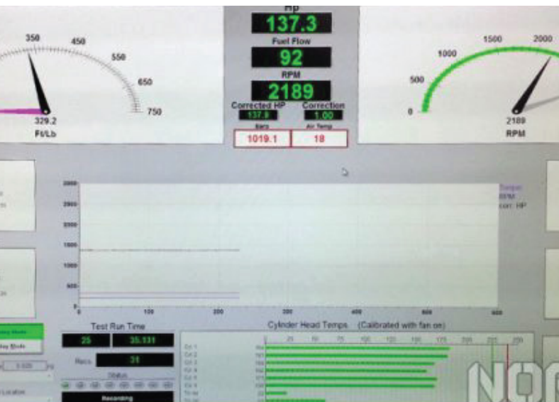
Engine Parameters Display

Our engineers conduct a full inventory and engine strip to identify parts needing repair, replacement or overhaul, then carry out exhaustive tests and upgrades to the highest professional standards. Replacement parts are then installed and the engine sent for testing on our own test-bed facility. The final step is a series of in-depth checks to ensure the engine is flawless and ready for delivery. See our quality control procedures in detail.